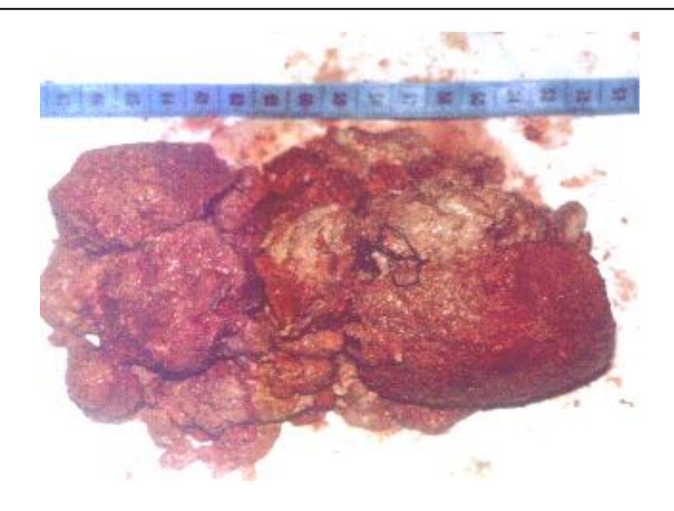
Pic. 3: Vaginal stone after removal with prolene suture.