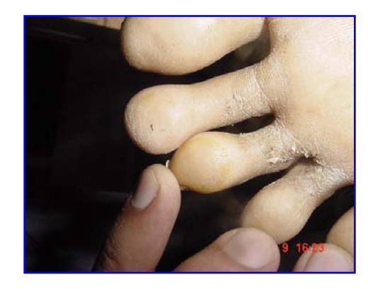
Fig-2: Dryness and Eruption of skin due to Autonomic Neuropathy