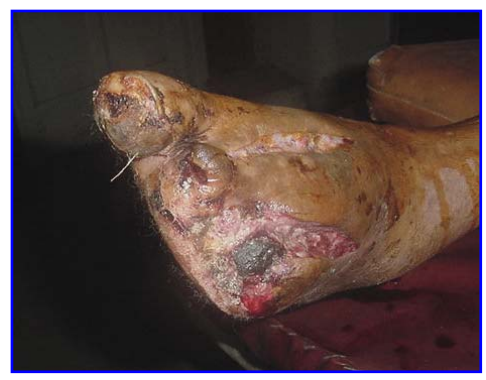
Fig-3: Partial Gangrene of Foot Grade IV.