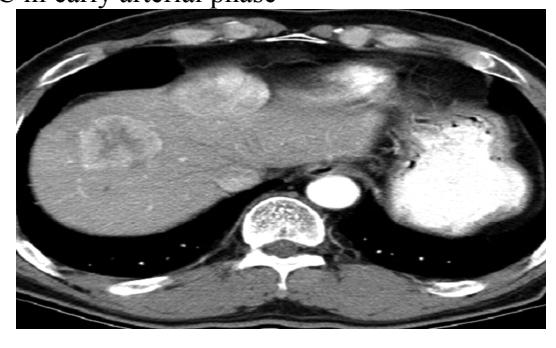
Figure- 1 HCC in early arterial phase

CT is better in evaluation of hepatic lesions<sup>4</sup>. Now even target sonographic data is being obtained of those lesions, which were not detected on ultrasound initially and were only detected on CT, MRI<sup>5</sup>. As compared to our study other international studies also document finding similar to our study.<sup>6</sup> Also now these guidelines are being matched for proper management of early HCC.<sup>7</sup> Early arterial phase CT is also used in following up of patient undergoing ablation therapy for HCC.<sup>8</sup>