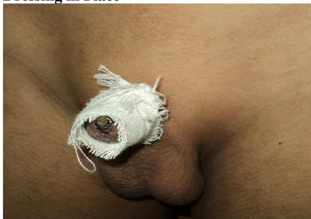
Figure-1 Patient In Standing Position with Stent and Dressing in Place