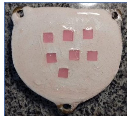
Figure 1: Wax pattern for Antifungal test of 10x10x2 mm invested in the flask using dental stone

Resin specimens for antifungal properties were stored in distilled water in a sealed container for 48 hours and 30 days at room temperature (Galav et al. , 2017). 13 After 48 hours and 30 days the specimen were desiccated and disinfected before subjecting to microbial tests. Adherence assay test was performed after water storage for 48 hours and 30 days.