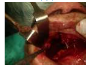
Figure 3: modified medial maxillectomy