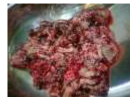
Figure 5: specimen collected

According to our study the mean age of presentation was 42.4 with earliest case being of a 28-year-old male. Most patients were in between the age of 31-40. (Table 1). It is lower than the