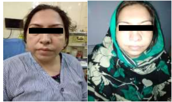
Pre-op picture 3 rd day Post-op picture of the same patient

Post-op morbidity: All the patients were counselled about the surgery and possible outcomes. After the surgery, pack was removed on 2 nd post-op day. No significant bleeding or facial deformity was seen. All patients were discharged after 5 th Post-op day. Patients didn't have any facial scar. Paresthesia was transient which resolved within 3 months.