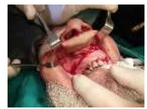
Figure 2: sub labial modified incision